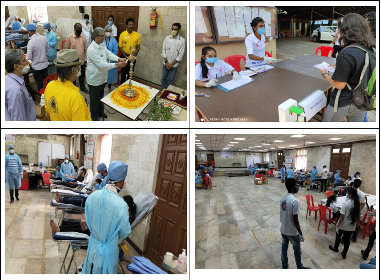
Attendance List of Blood Donation Camp - Ramanand Arya DAV College NSS UNIT.xlsx